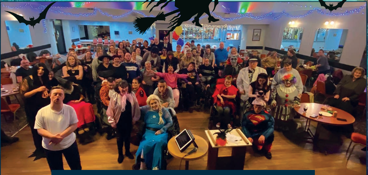
Everyone enjoying the UPTAE Halloween party